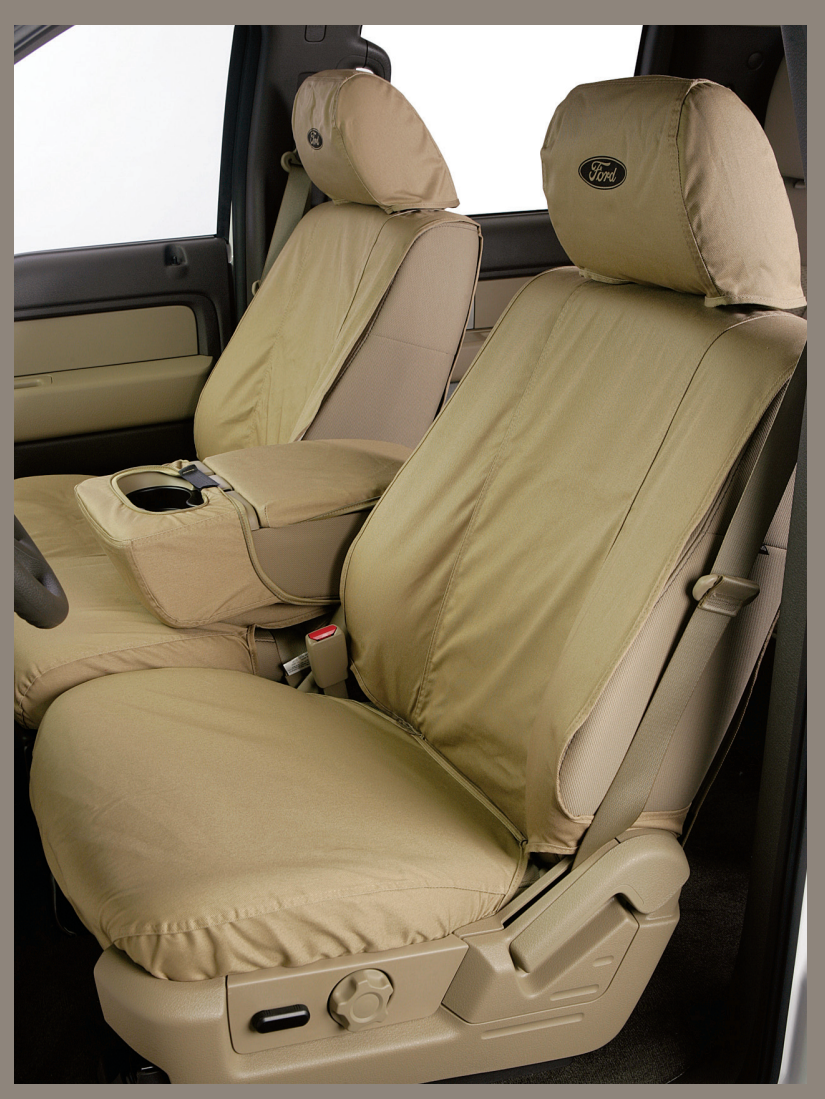
Keep your seats looking new for years with slip-on SeatSaver® seat protectors.