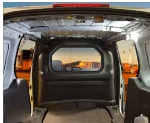
Shown with available window