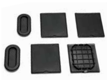
Upper Plug Kit