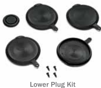
Lower Plug Kit