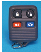
Type 8 * Switch with #1 or #2 on Back. Gray Color