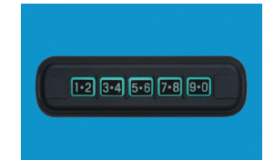
Type 15 Wireless RF Keypad