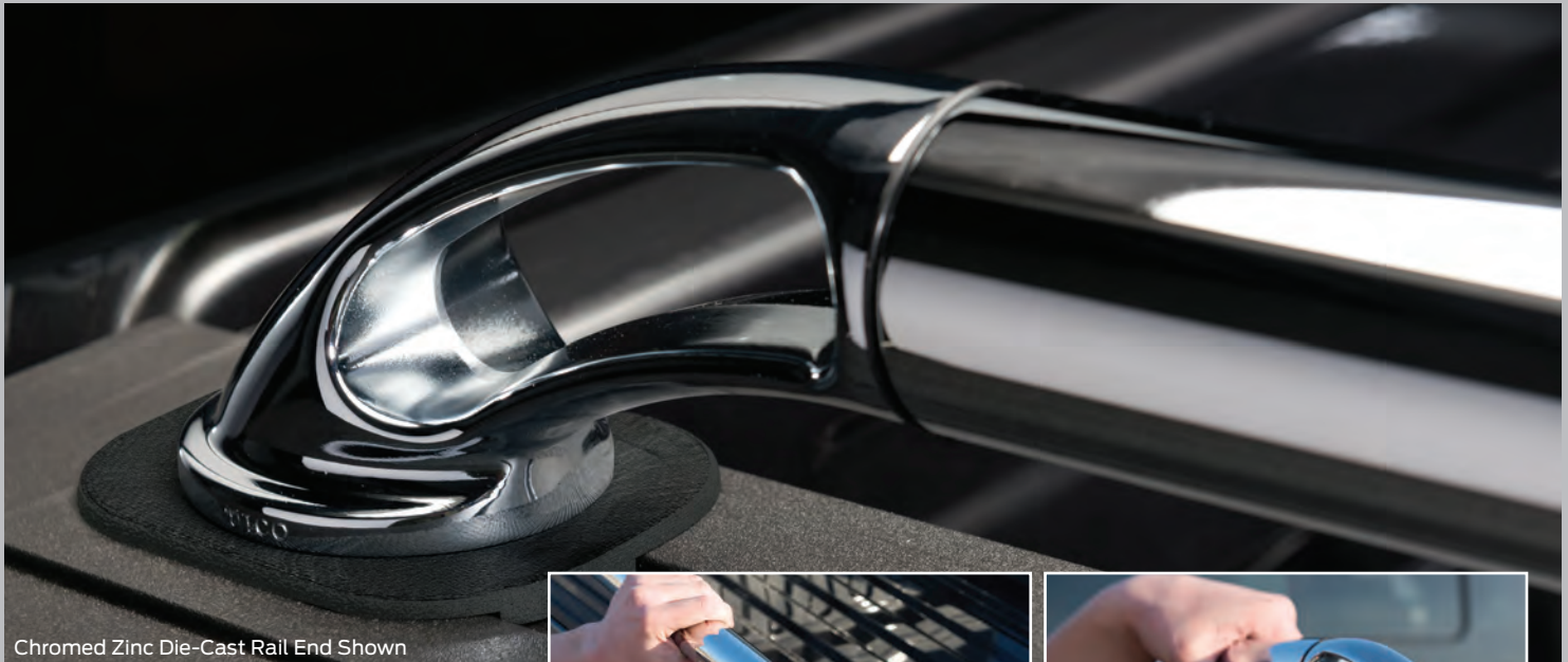
Chromed Zinc Die-Cast Rail End Shown

These high quality Bed Rails provide useful functionality as tie down anchors and add an attractive touch of style to your F-150. Durable T-304 stainless steel 1-3/4" tubing and cast tie-down ends enhance the truck's tough appearance.